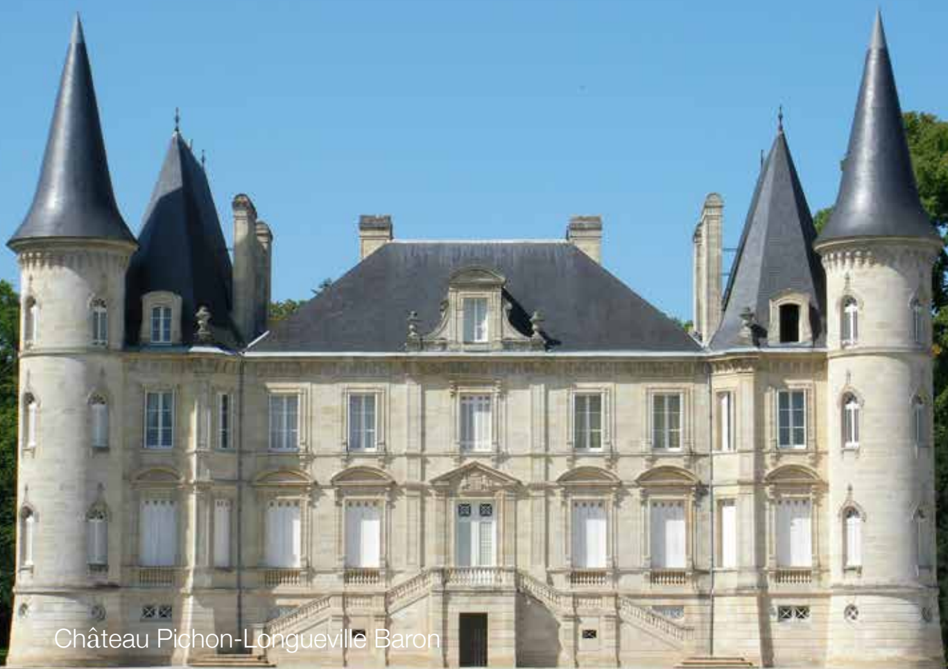
Château Pichon-Longueville Baron