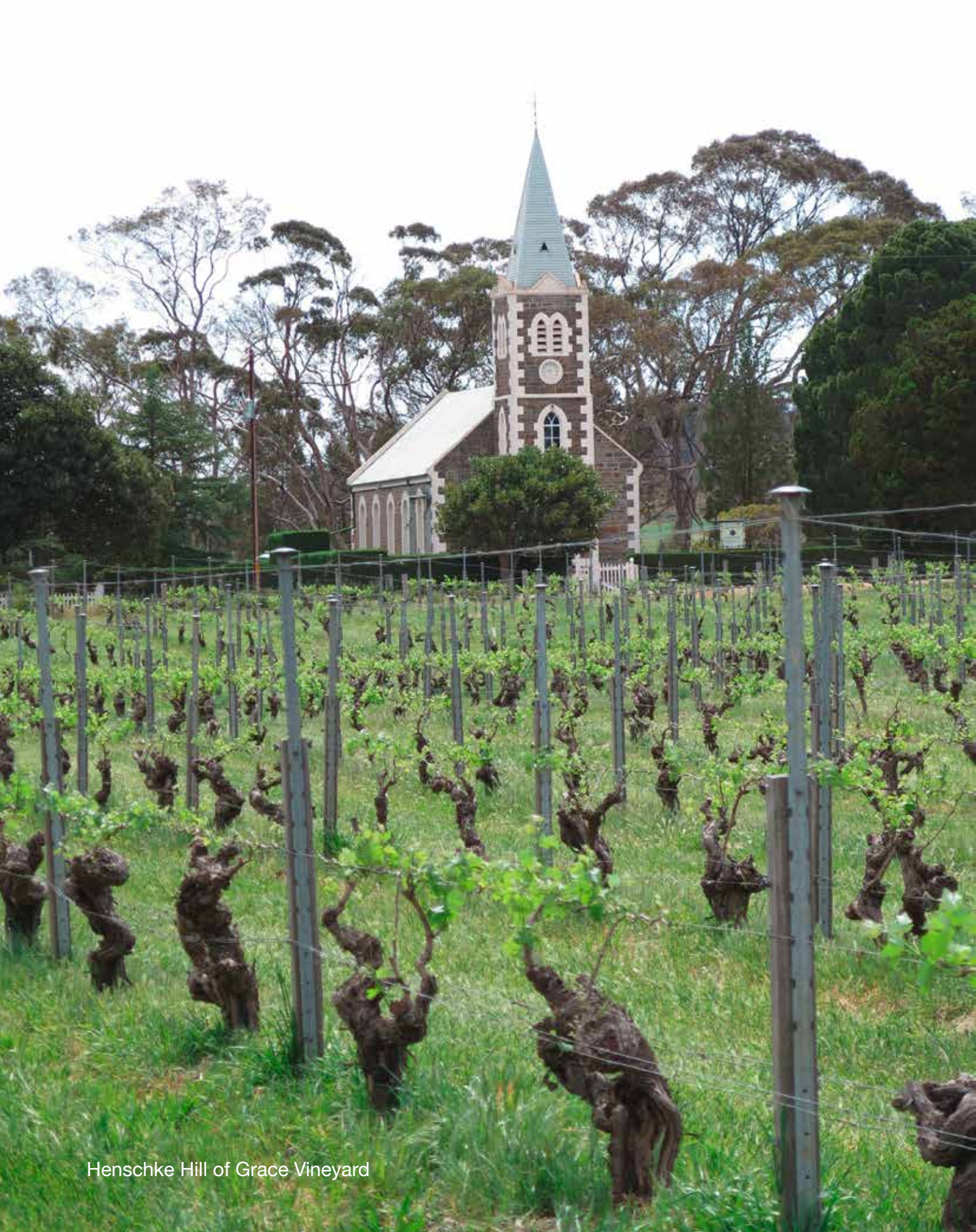
Henschke Hill of Grace Vineyard